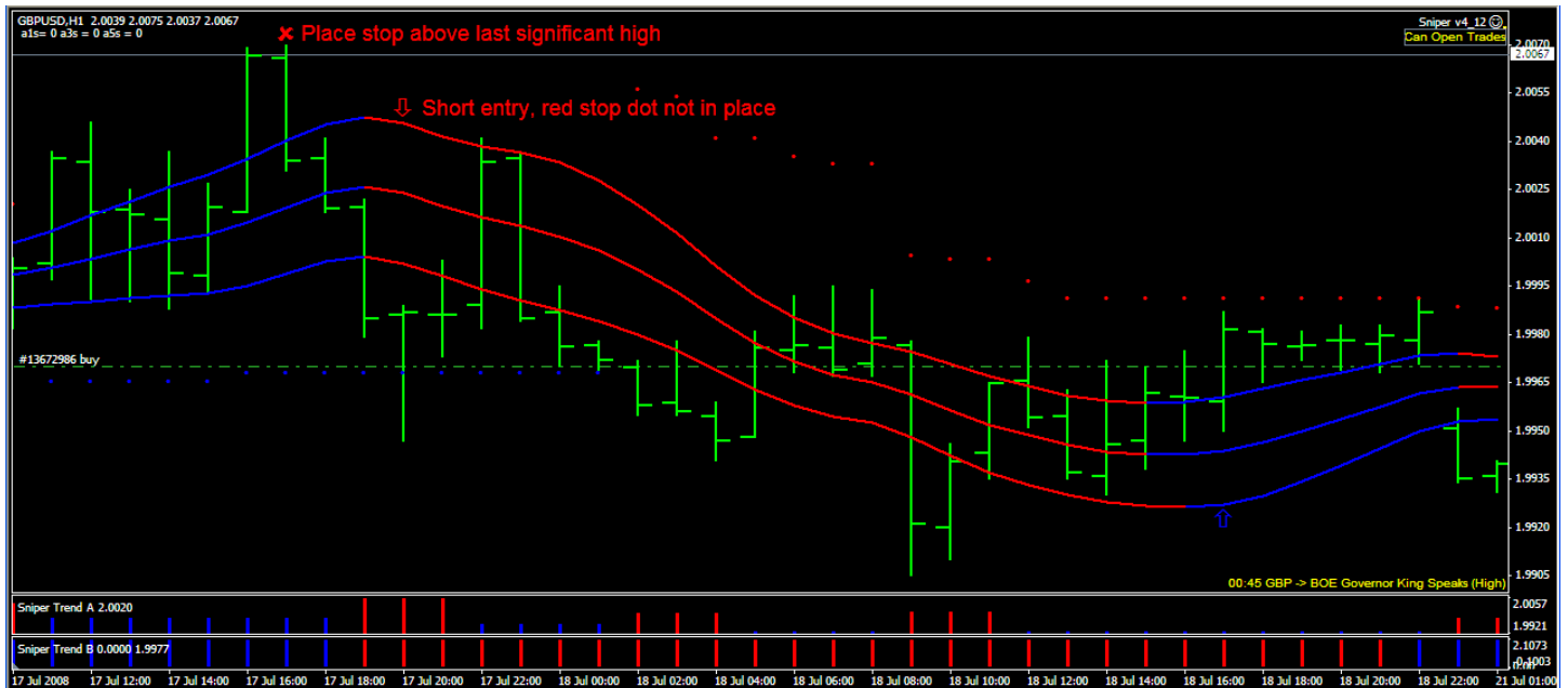
Fig 4: When the stop dot is not in place at the time of entry, place your stop just above the last significant high in a short trade and just below the last significant low in a long trade . When the stop dot moves in to place move your stop accordingly.